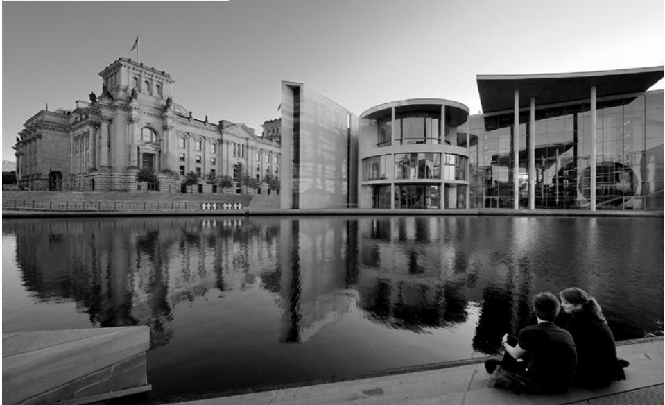
German Bundestag at the river Spree